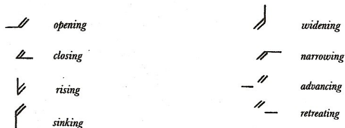
Figure 3. Notation for shaping features.